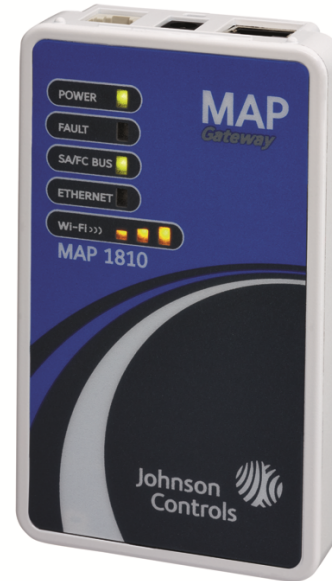
Figure 1: Mobile Access Portal Gateway

The MAP Gateway cannot be used on Smoke Control systems or at Metasys for Validated Environment (MVE) sites.